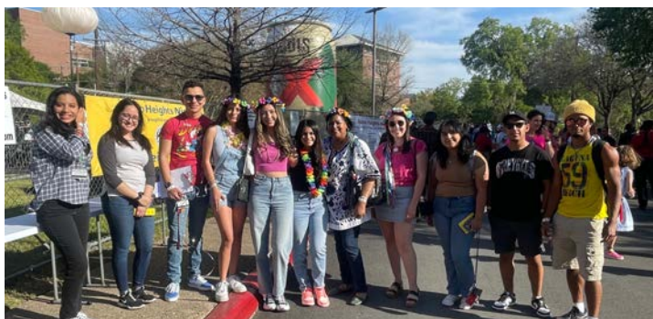
TRiO at Alamo Heights Night April 2022