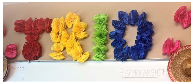
Fiesta decorations handcrafted by TRiO Students