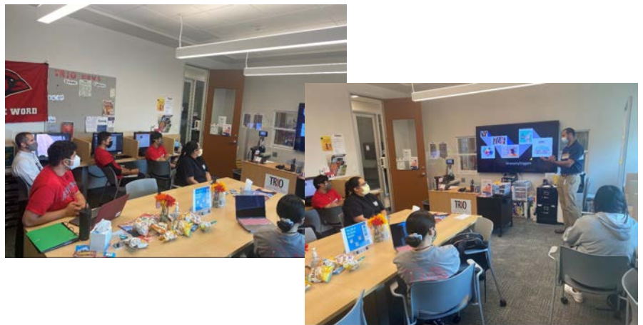
Behavioral Services meets with TRiO