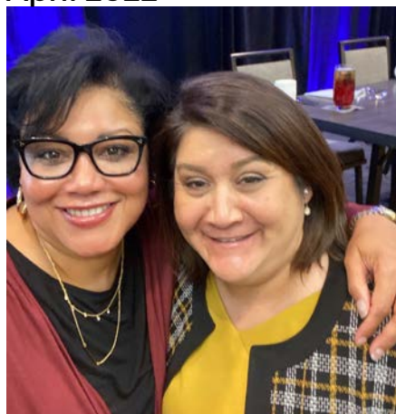
Celebrating 20 years of friendship and service