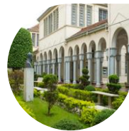
Ipiranga Campus Sao Paulo