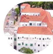
Sorocaba Campus Sorocaba