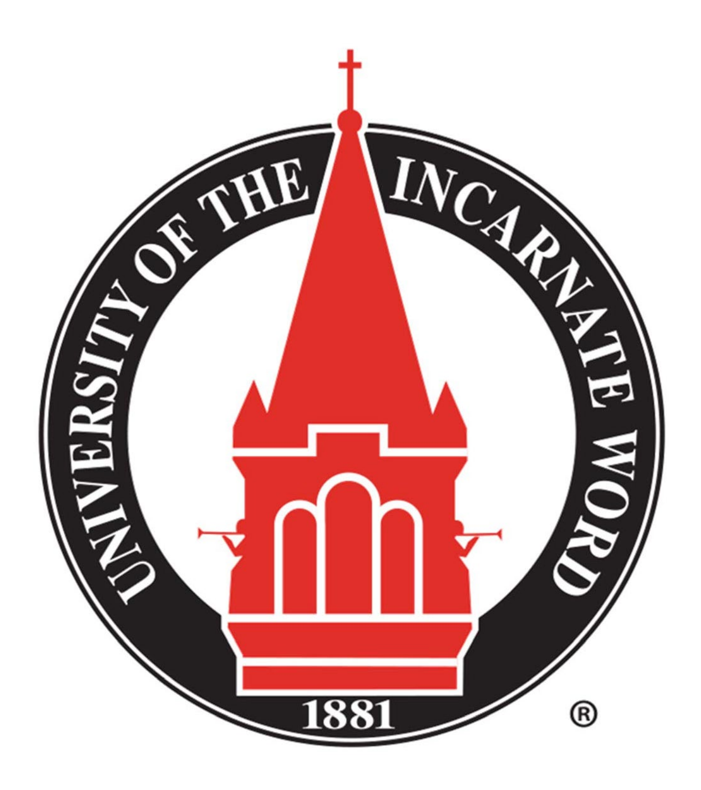
Parking and Traffic Regulations