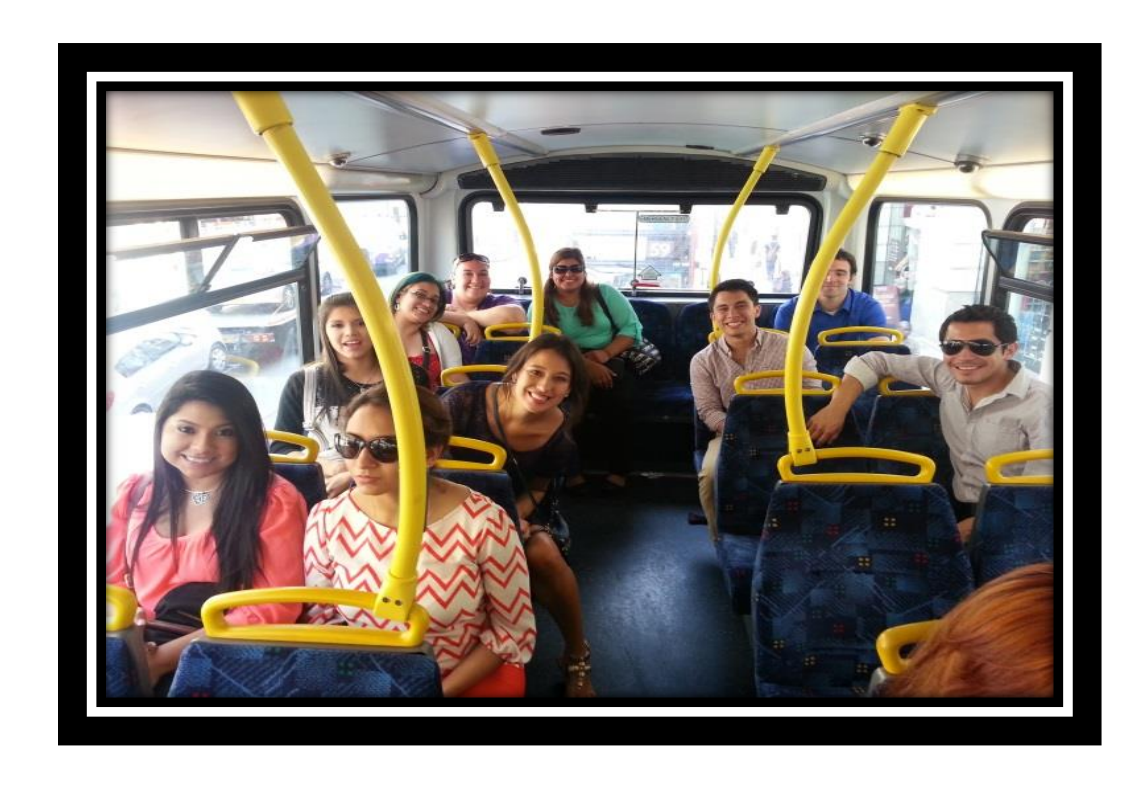
On our way to a site visit on one of England's red buses