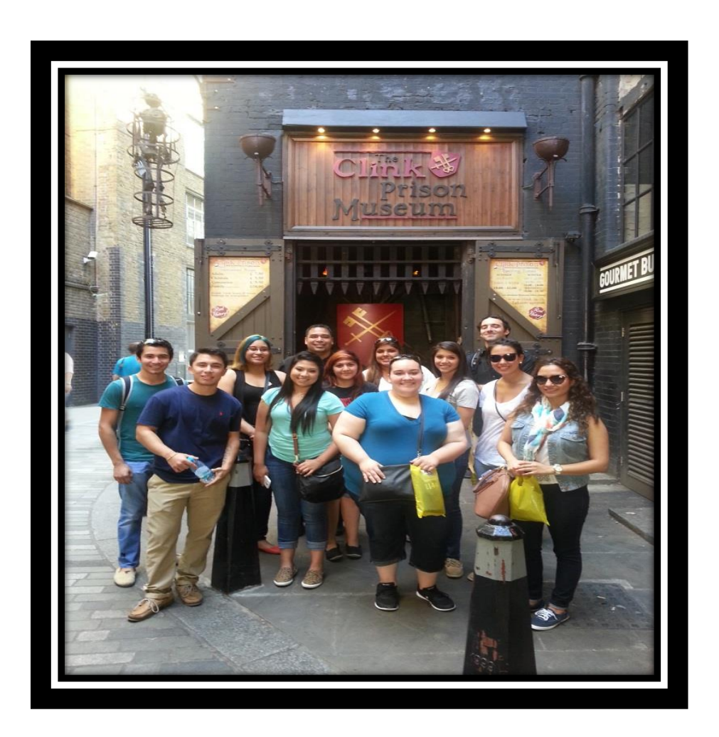
At the Clink Prison Museum