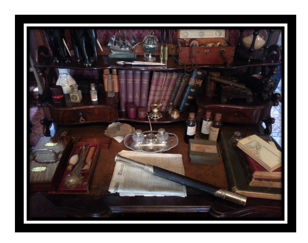
Inside the Sherlock Holmes Museum