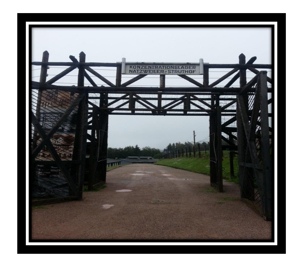
Main entry to Natzweiler Struthof concentration camp