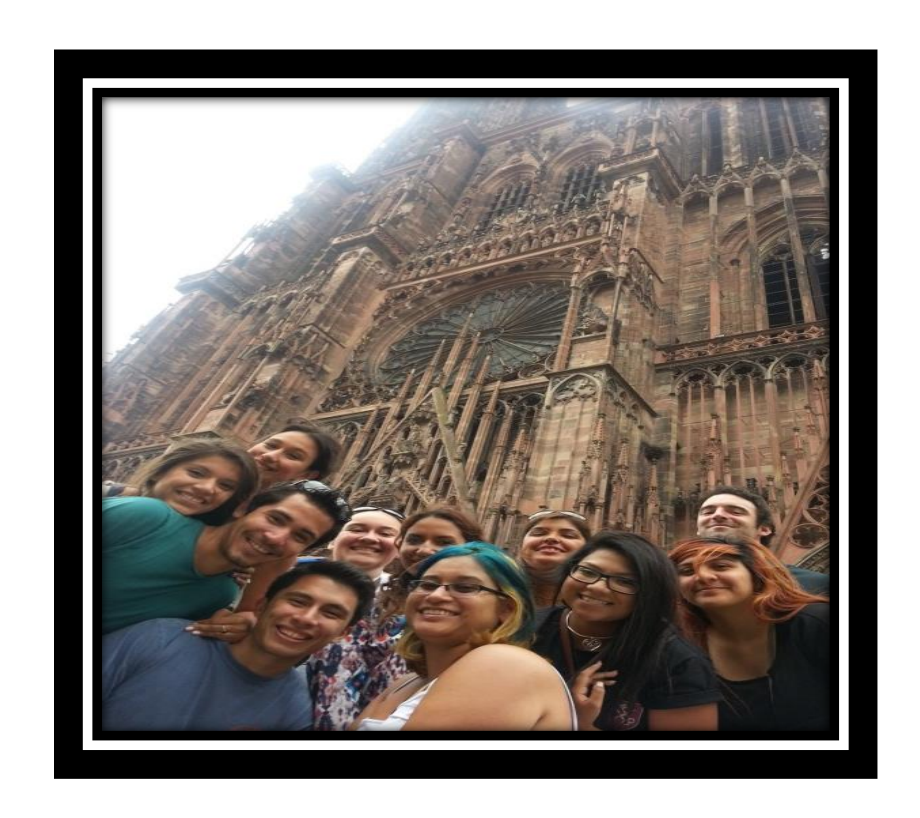
In front of Strasbourg Cathedral - Strasbourg, France