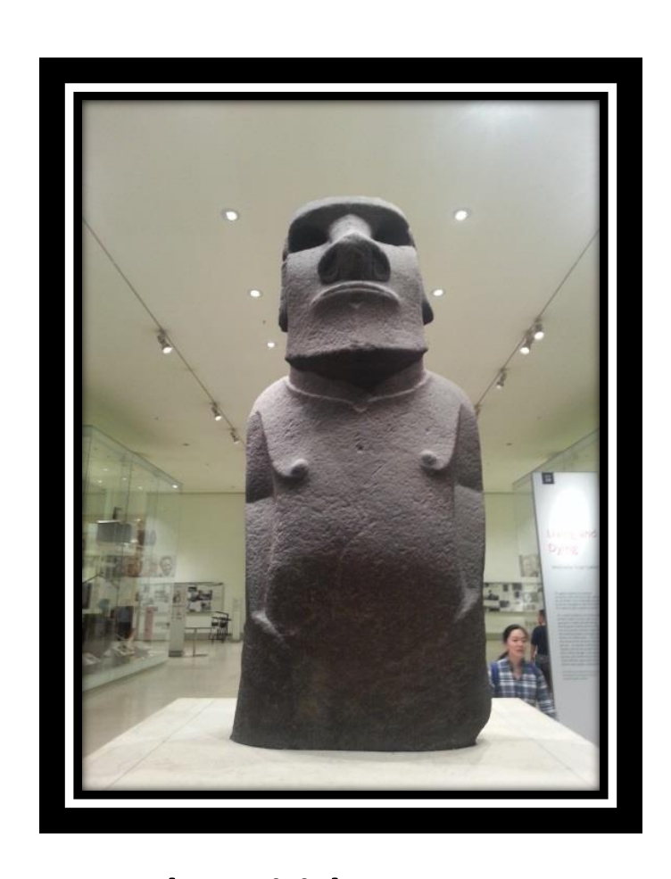
The British Museum