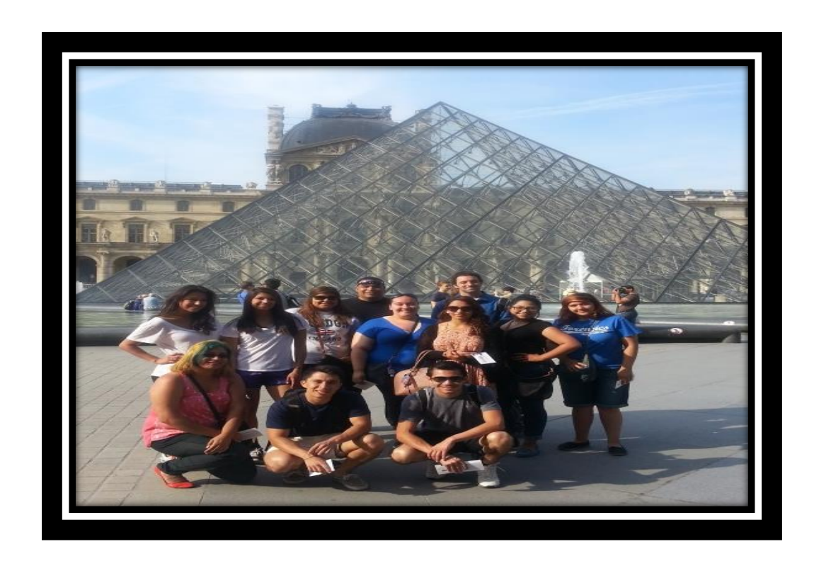
In front of the main entry at the Louvre Museum – Paris, France