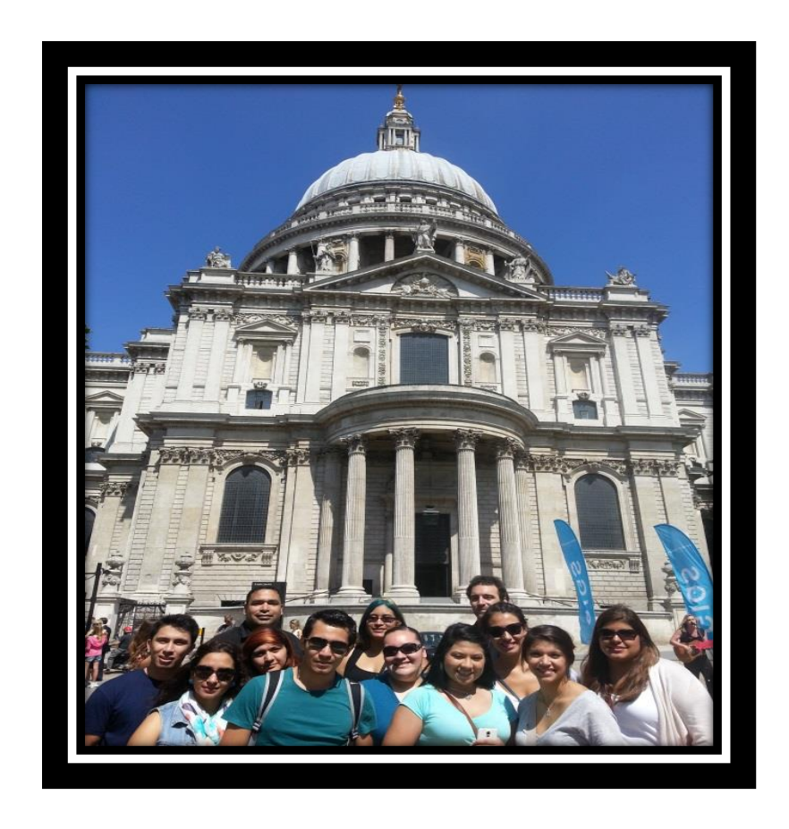
Outside of Saint Paul's Cathedral