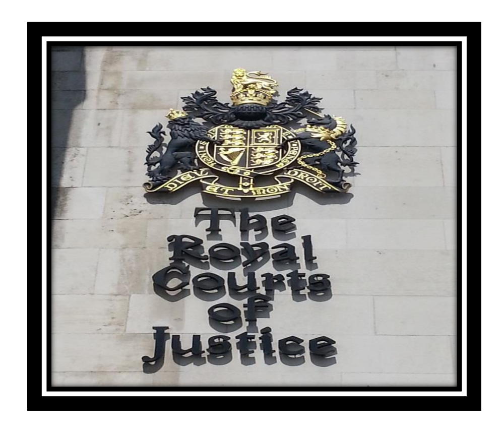
As noted, the Royal Courts of Justice.