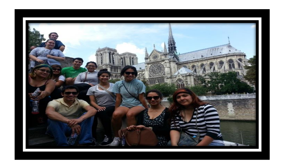
In front of Notre Dame Cathedral