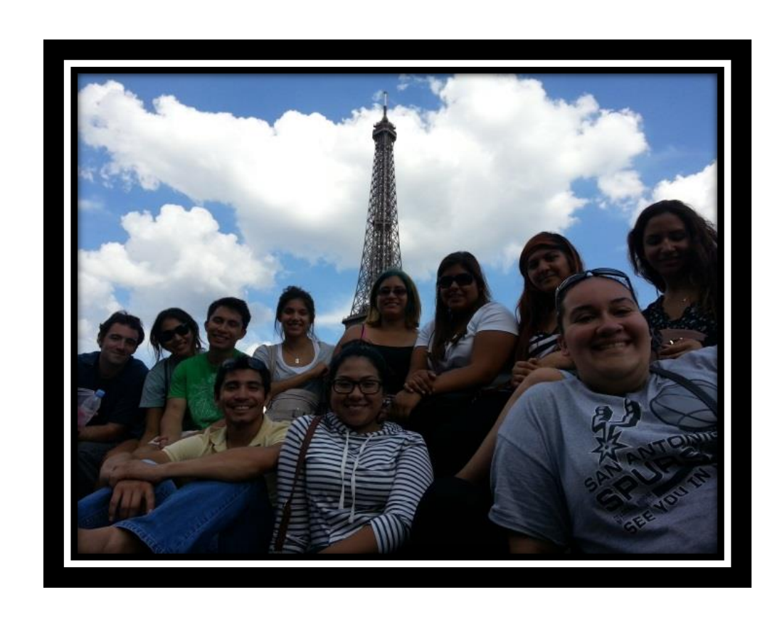
In front of the Eiffel Tower