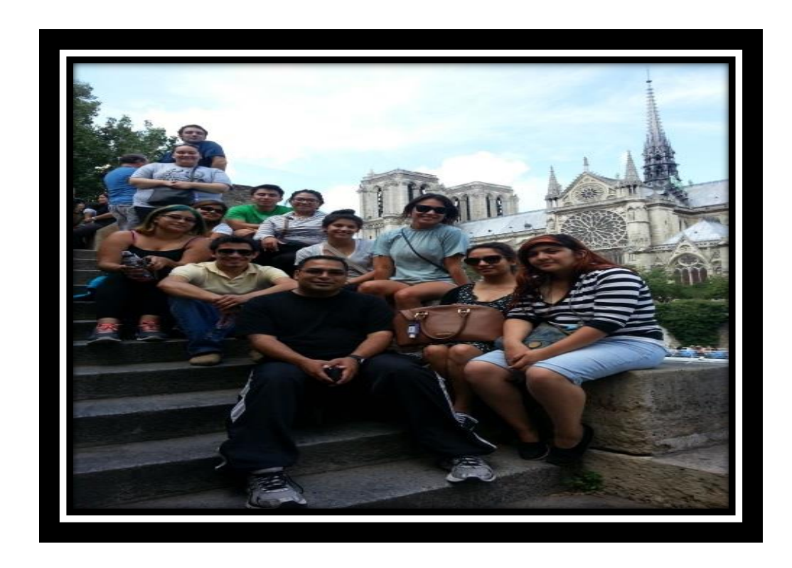
In front of Notre Dame Cathedral