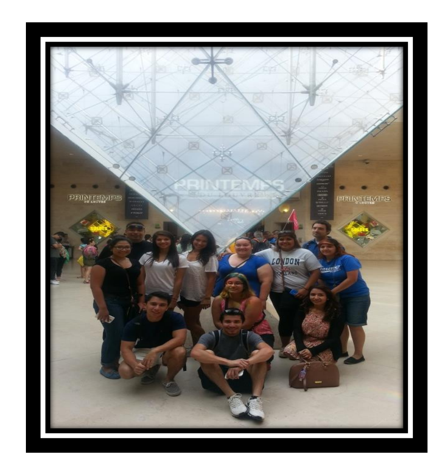
The inverted pyramid inside the Louvre Museum