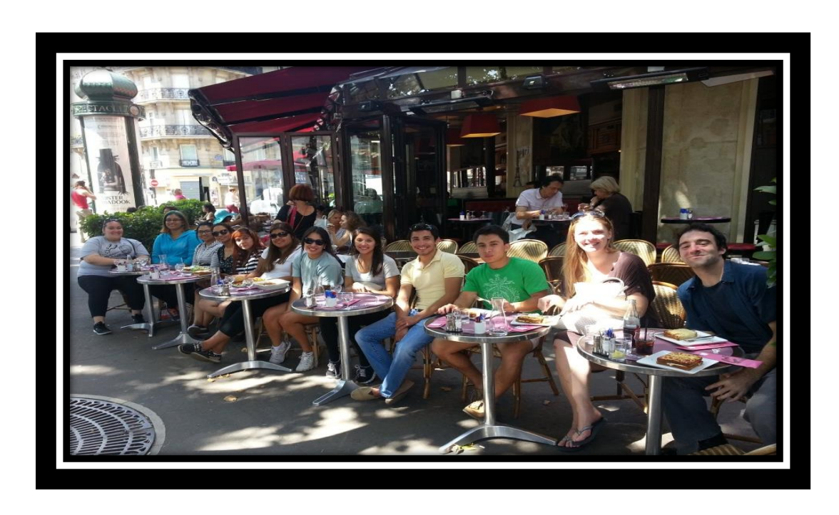
Having lunch and people watching in Paris, France