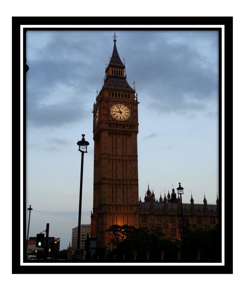
Big Ben Tower