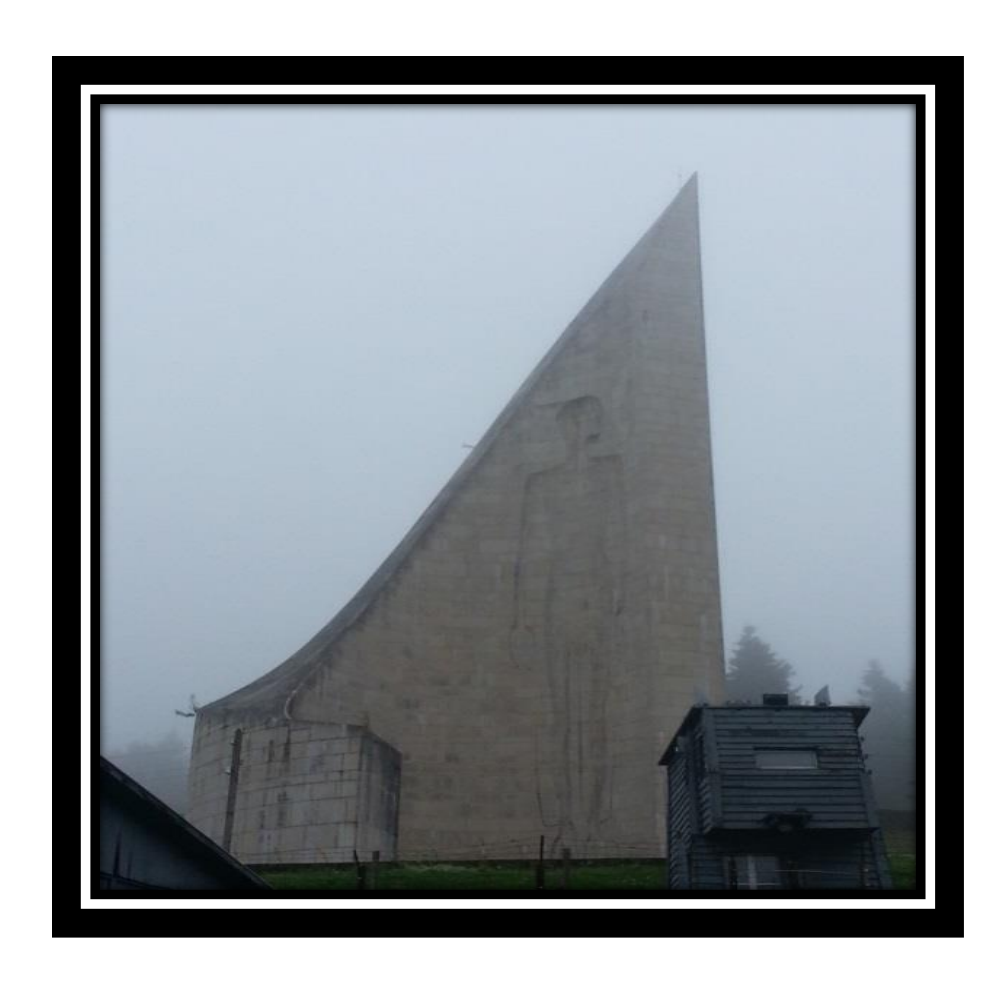
Natzweiler Struthof Memorial