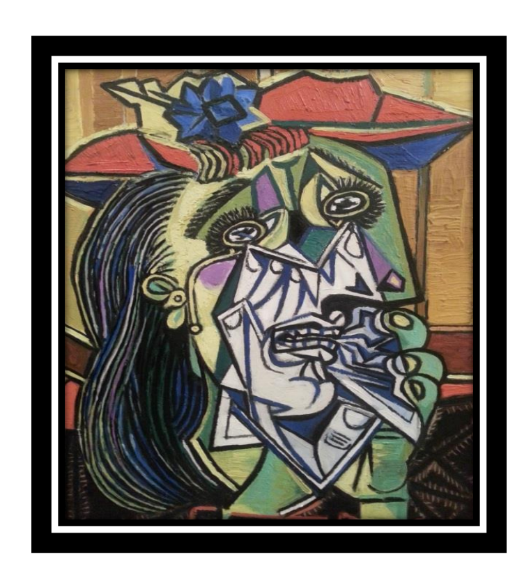
Picasso's Weeping Woman inside the Tate Modern Museum