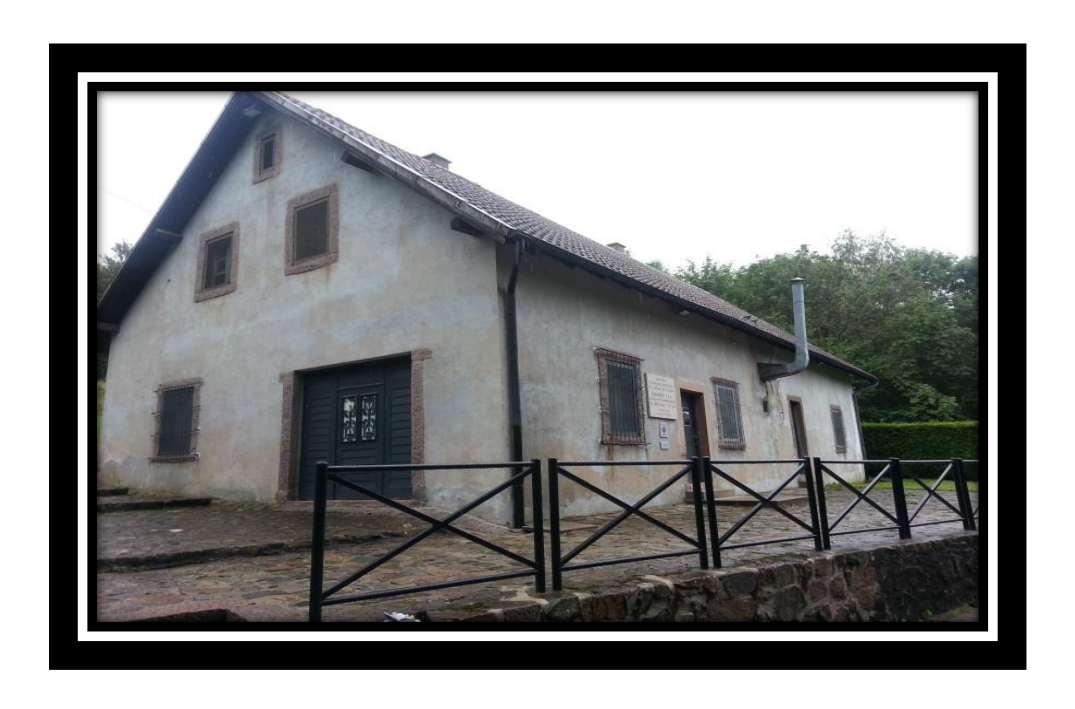
Gas Chamber at Natzweiler Struthof