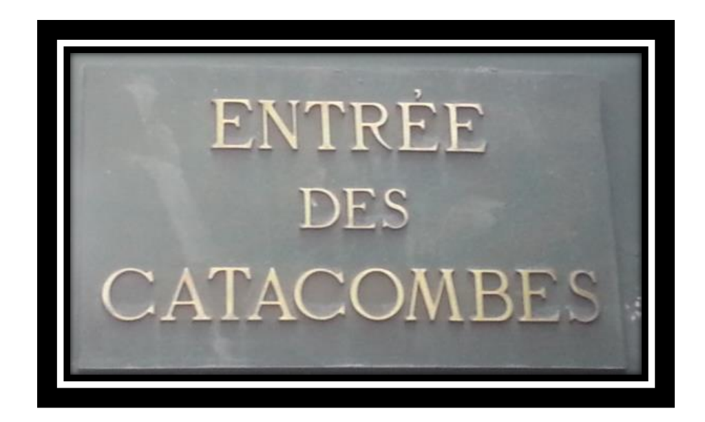
Main entry to the Paris Catacombs