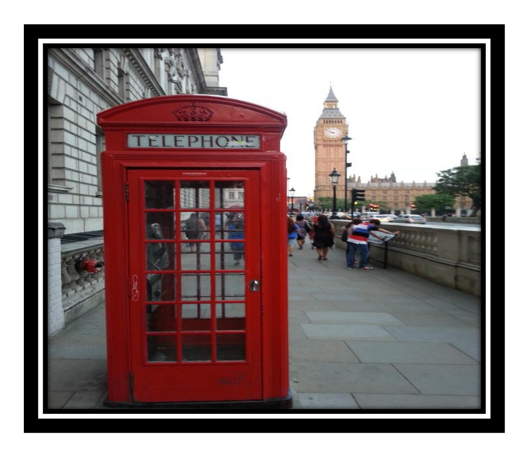
Big Ben Tower with the famous red phone booth in the UK