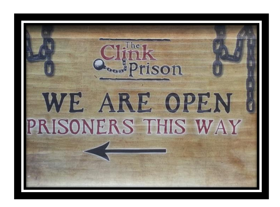
The Clink Prison Museum - London