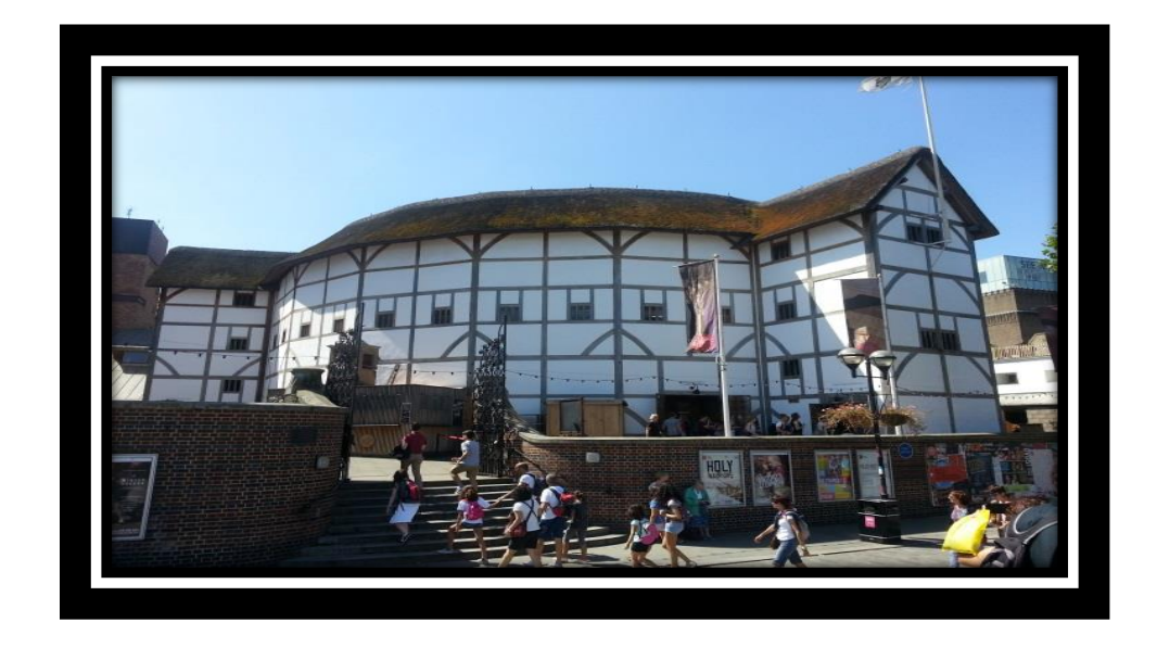
Shakespeare's Globe Theatre – London