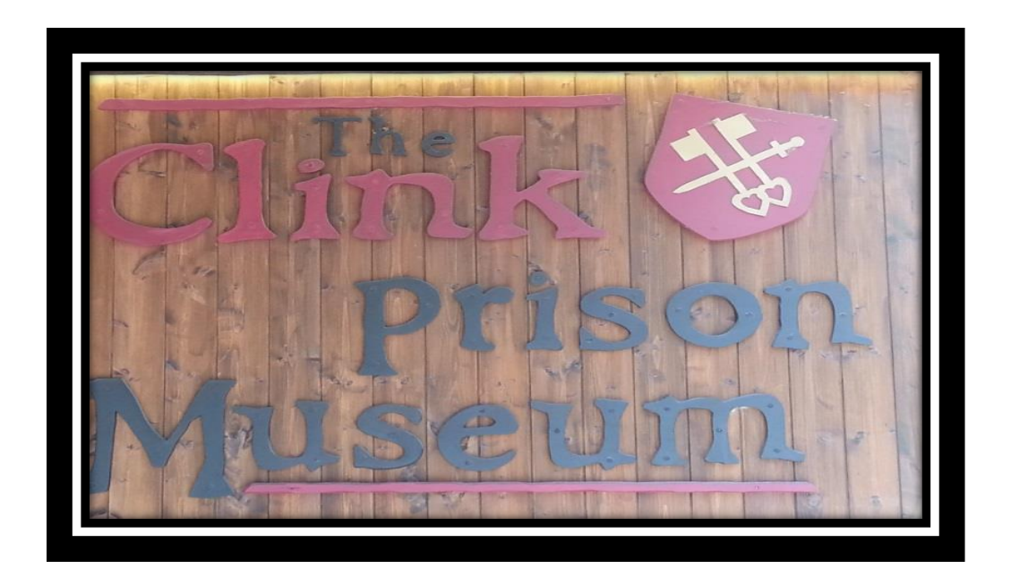
The Clink Prison Museum - London