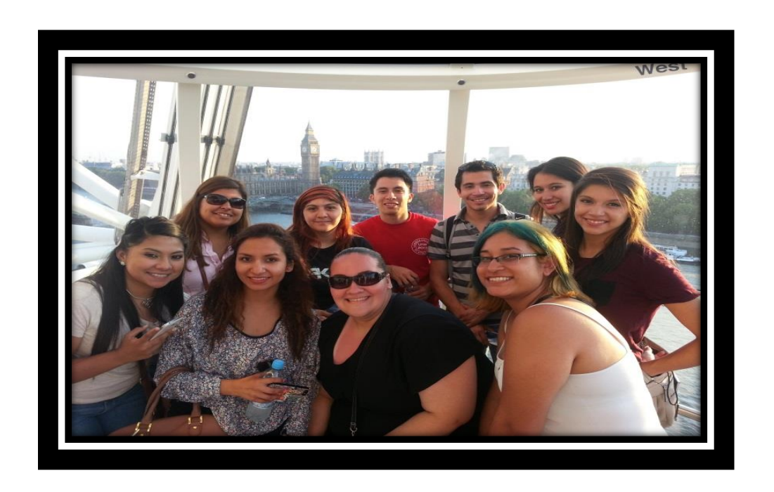
Inside the London Eye