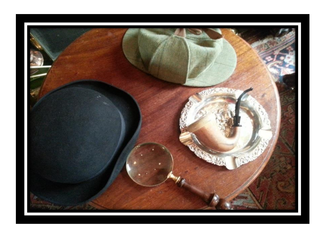
Inside the Sherlock Holmes Museum