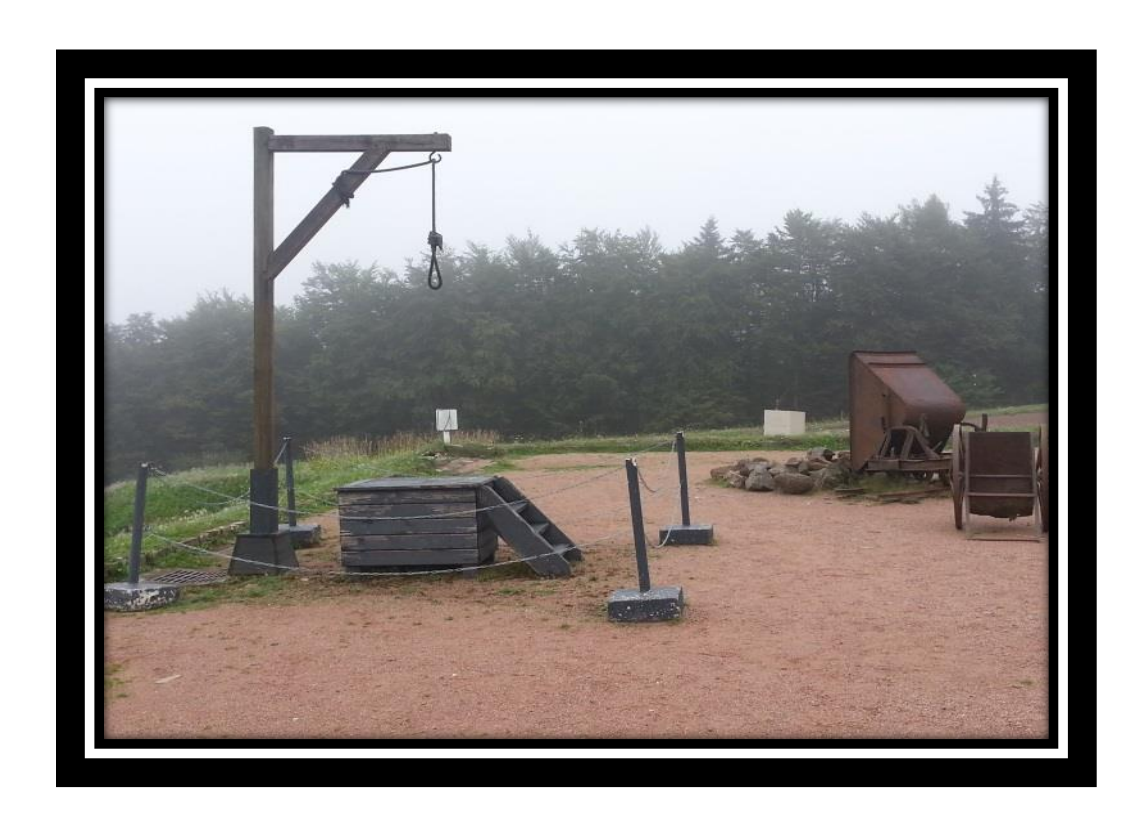
Execution site at the concentration camp