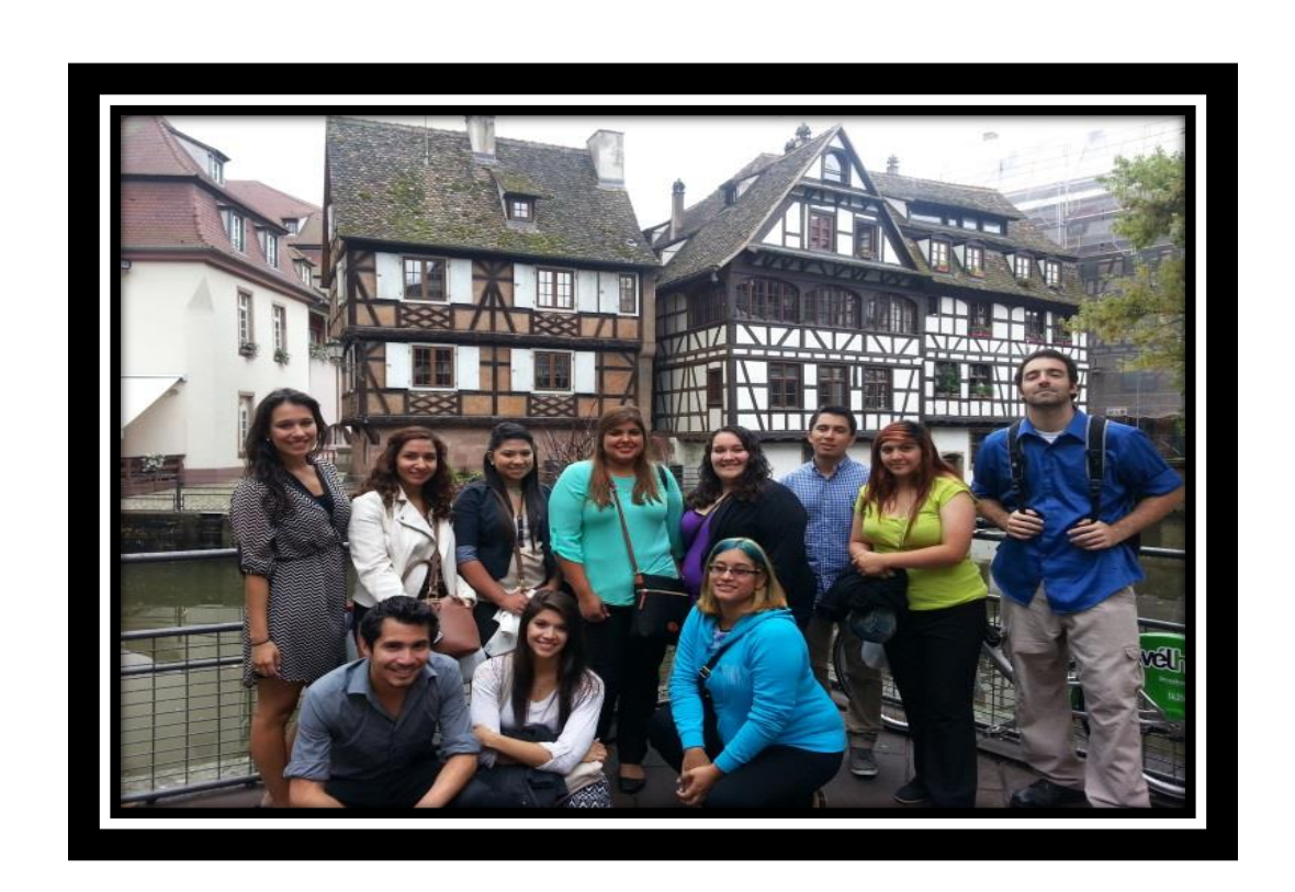
The "Students of Crime" saying good bye from La Petite France in Strasbourg