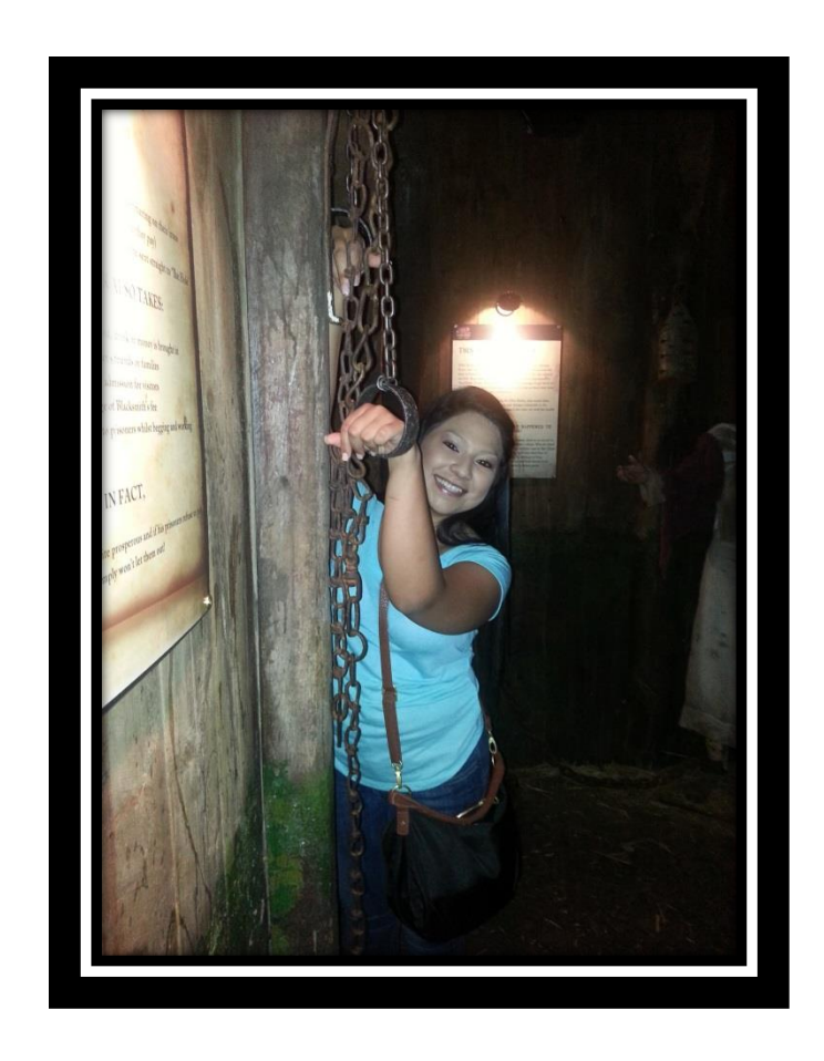
International Criminal Desiree Guardiola