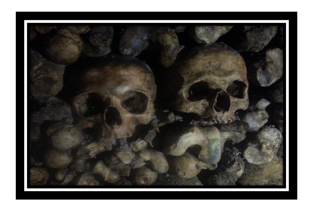
The Paris Catacombs