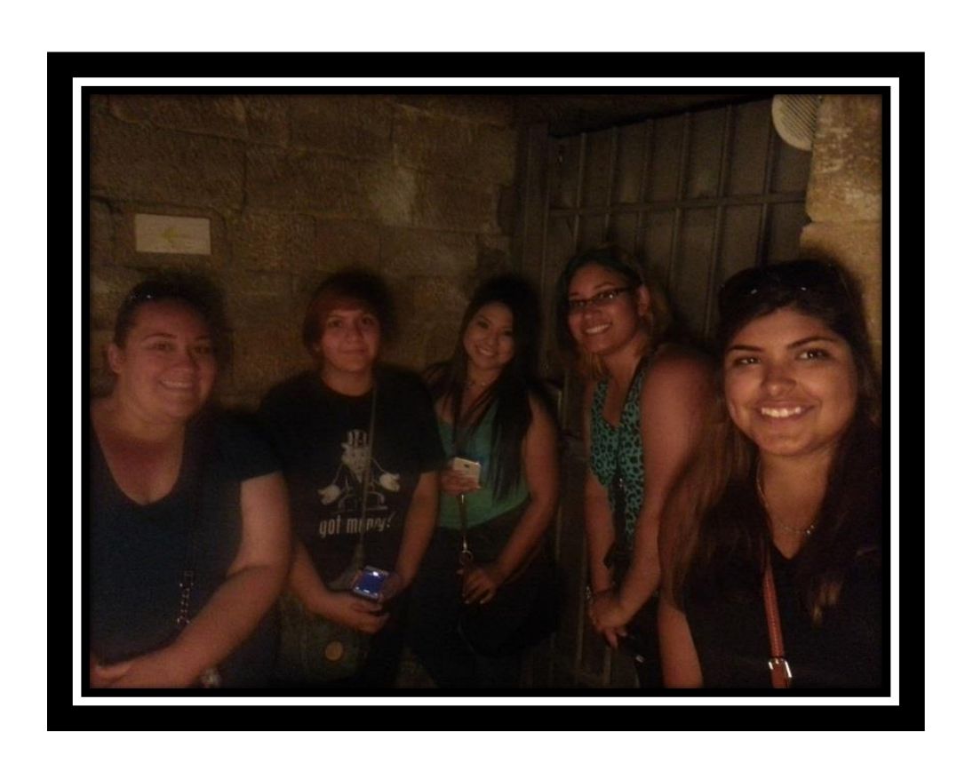
Inside the Catacombs