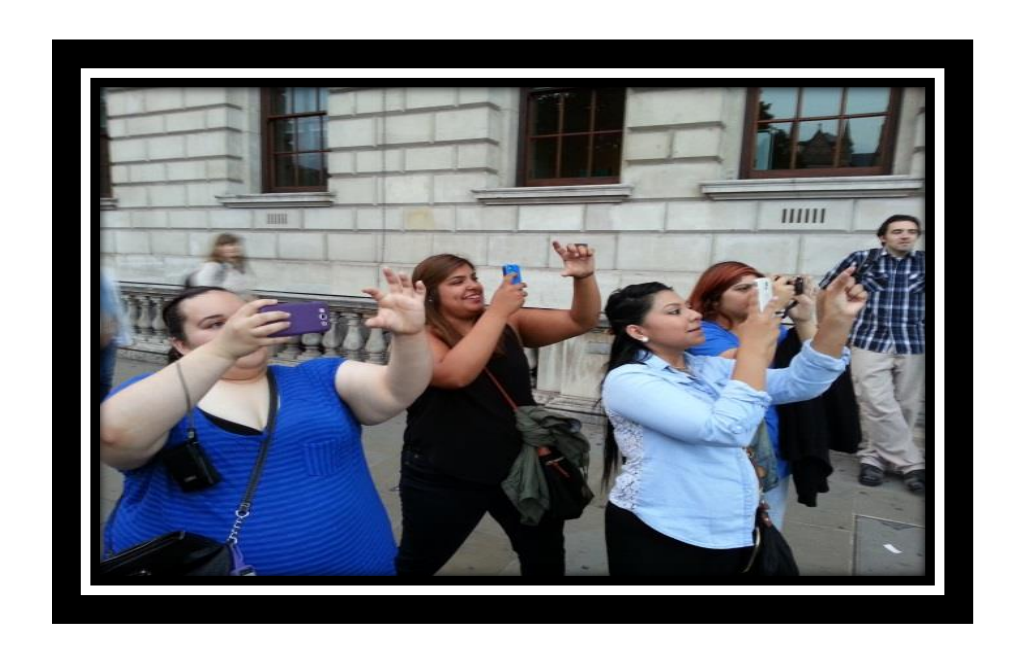
How big is the Big Ben Tower?