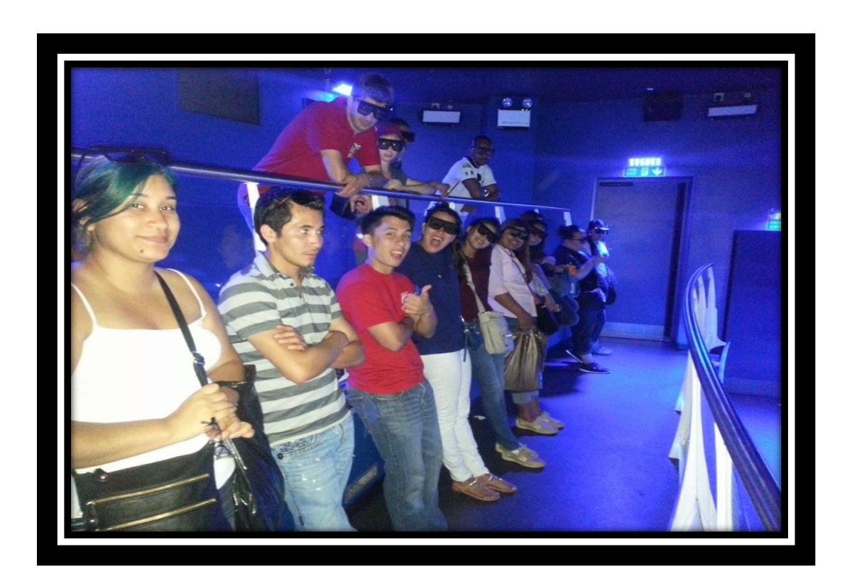
At a 4-D IMAX showing