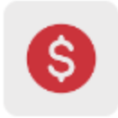
CashNet ePayment Center