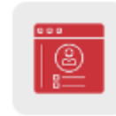
B9 My Profile (Personal Info/Direc...