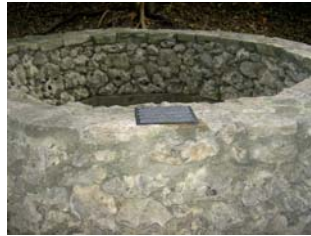
“Blue Hole”—headwaters of the San Antonio River

The Headwaters Project coordinators believe that their mission is “to preserve and restore the land including and surrounding the Blue Hole, headwaters of the San Antonio River, whose stewardship rests with the Congregation of the Sisters of Charity of the Incarnate Word.