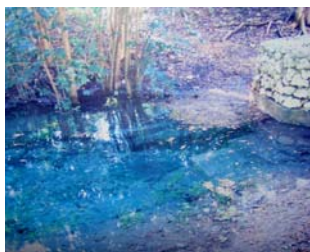
The blue hole is a central feature of the land included in the Headwaters Coalition.