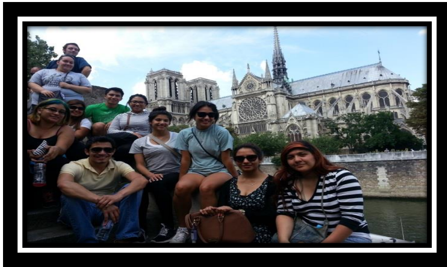
In front of Notre Dame Cathedral