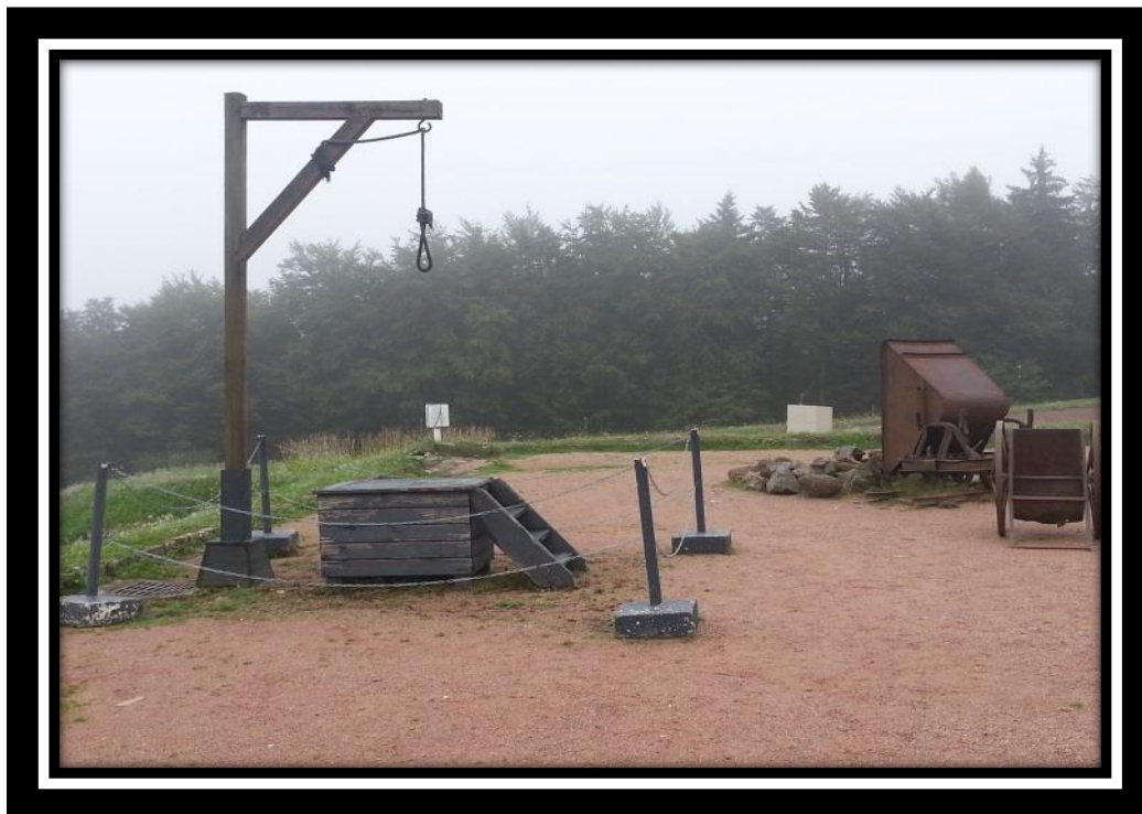
Execution site at the concentration camp