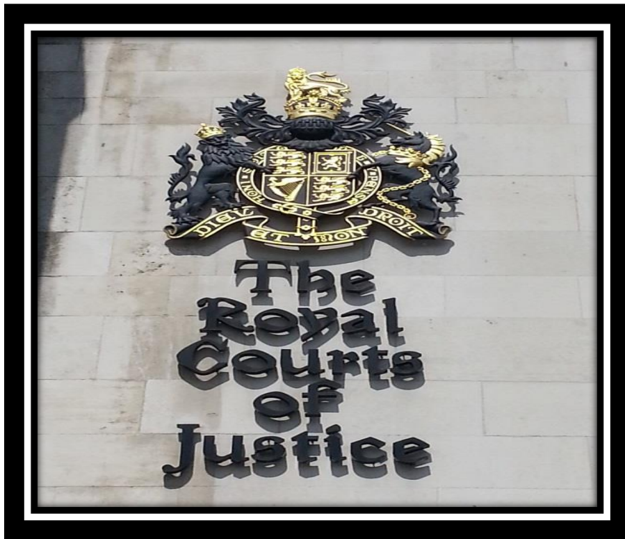
As noted, the Royal Courts of Justice.