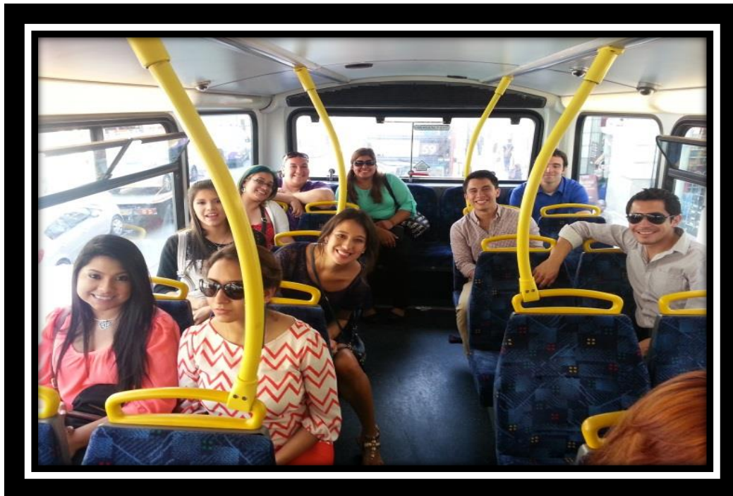
On our way to a site visit on one of England's red buses