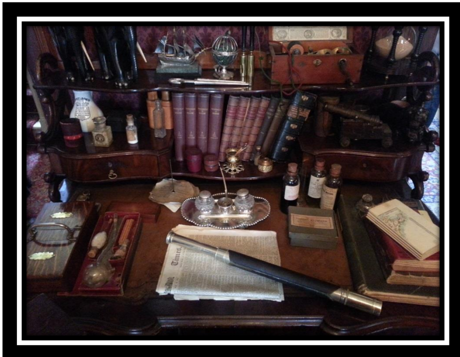
Inside the Sherlock Holmes Museum