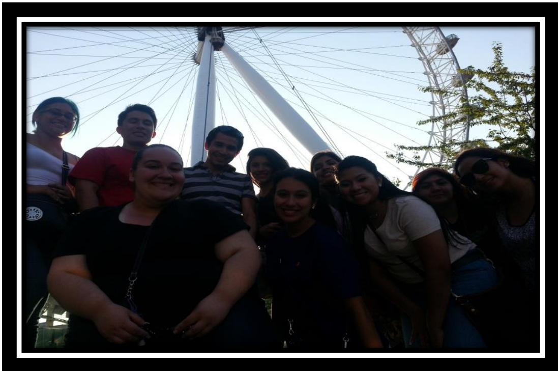
The London Eye