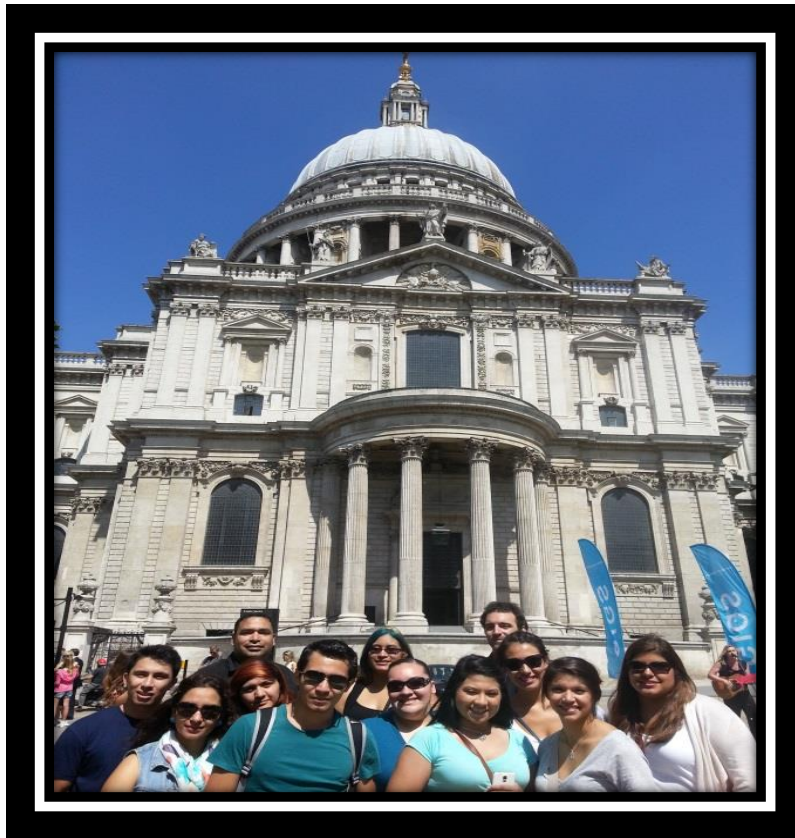
Outside of Saint Paul's Cathedral