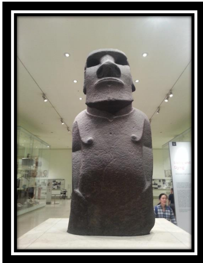
The British Museum