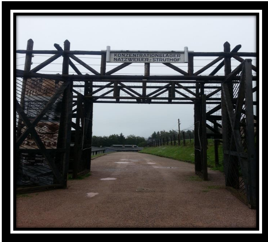
Main entry to Natzweiler Struthof concentration camp