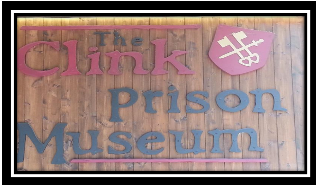
The Clink Prison Museum - London