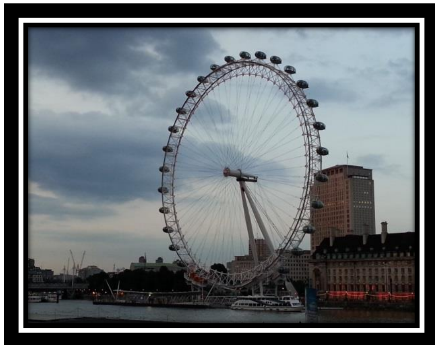
The London Eye