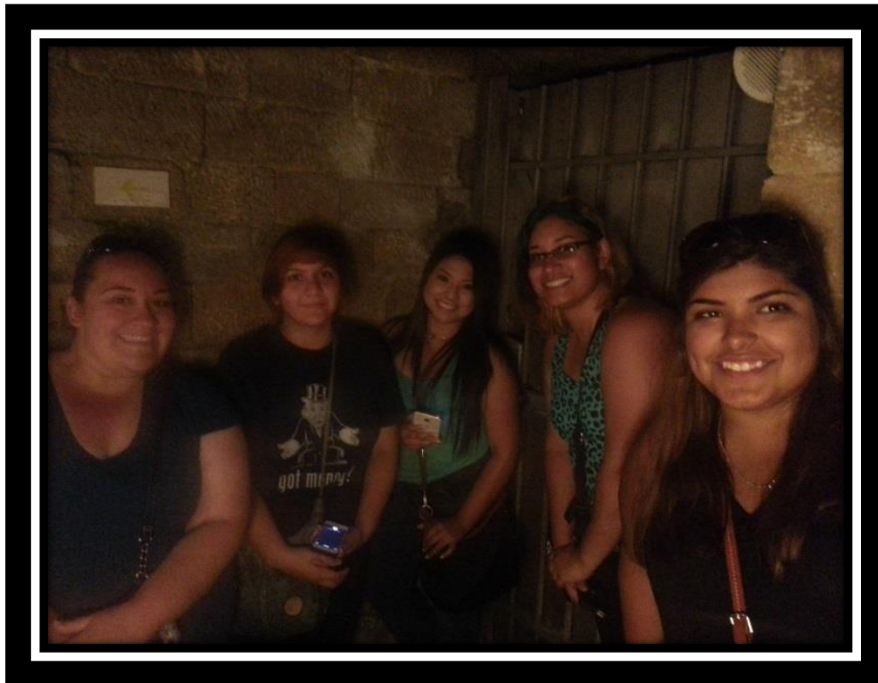
Inside the Catacombs