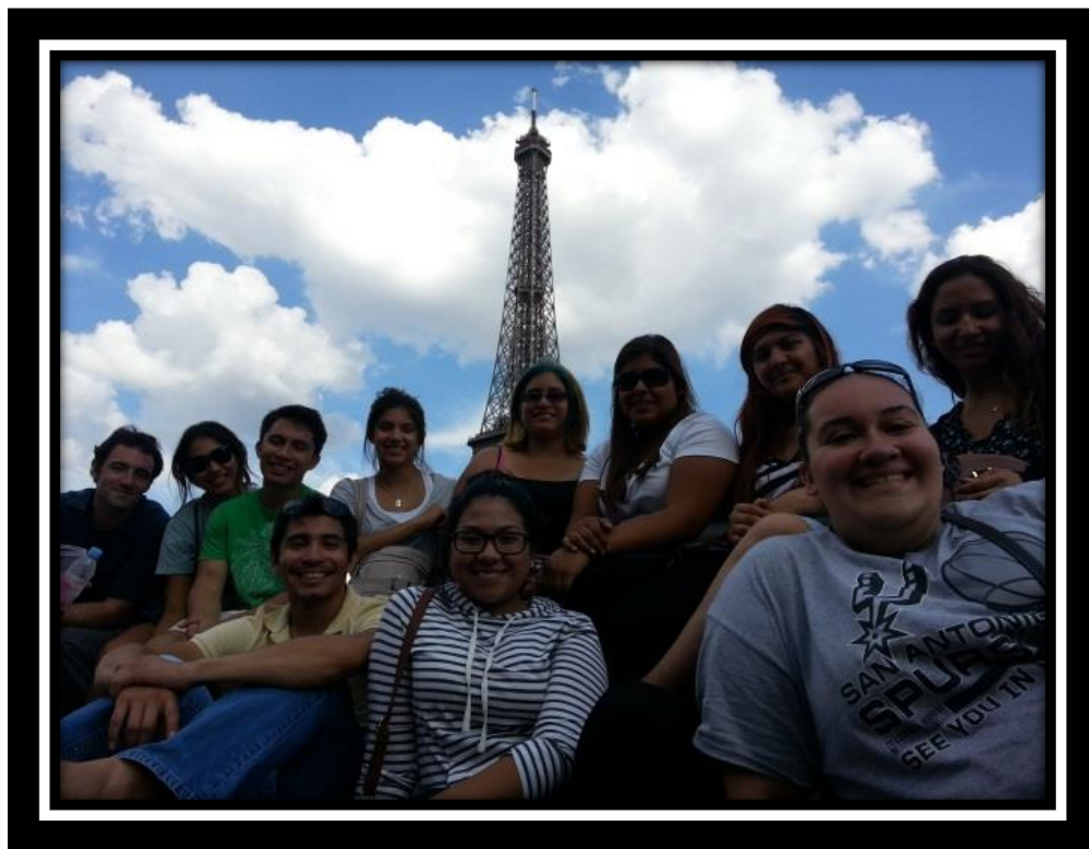
In front of the Eiffel Tower