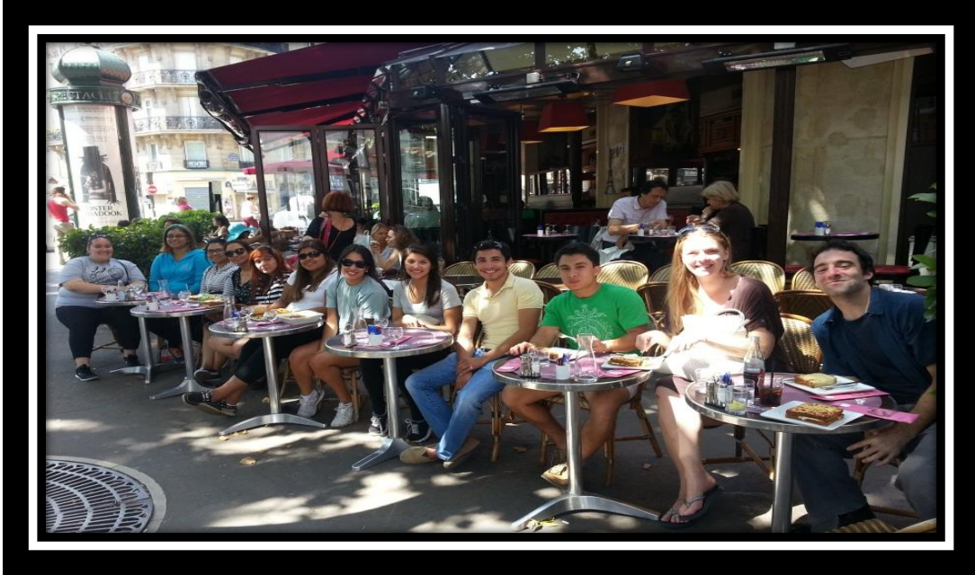
Having lunch and people watching in Paris, France