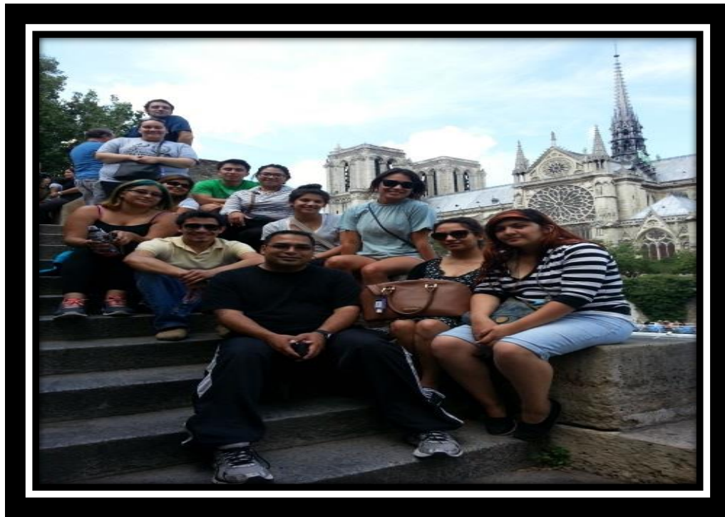
In front of Notre Dame Cathedral