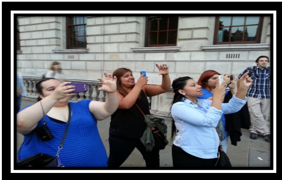
How big is the Big Ben Tower?