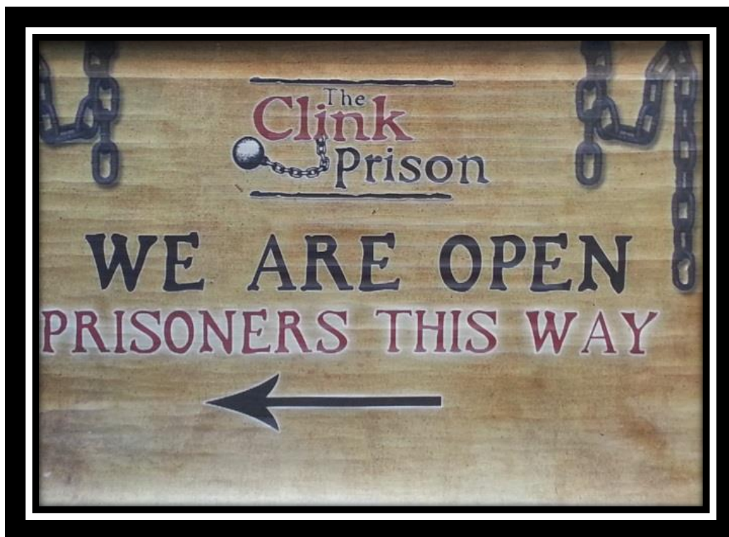
The Clink Prison Museum - London