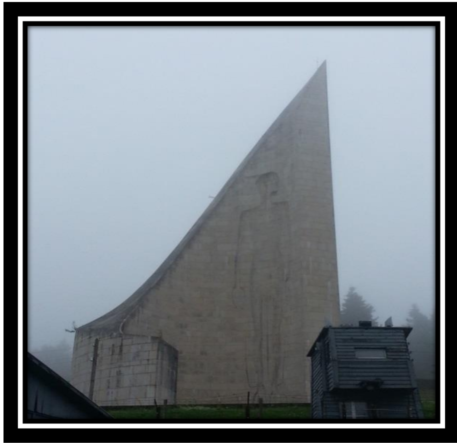
Natzweiler Struthof Memorial