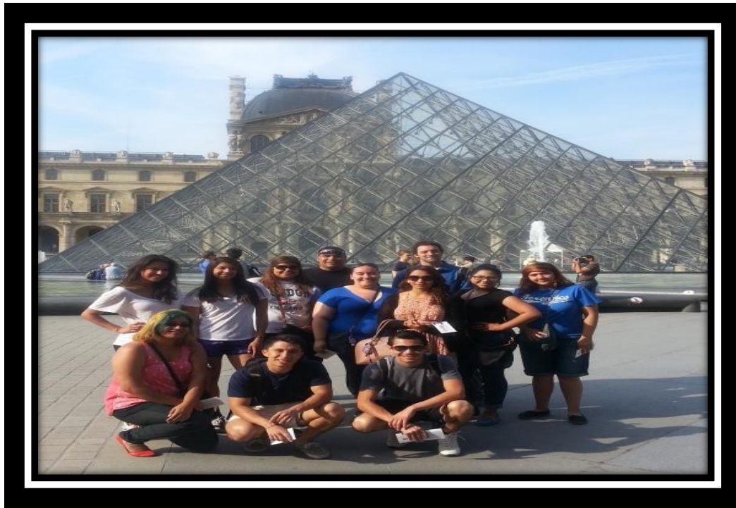
In front of the main entry at the Louvre Museum – Paris, France