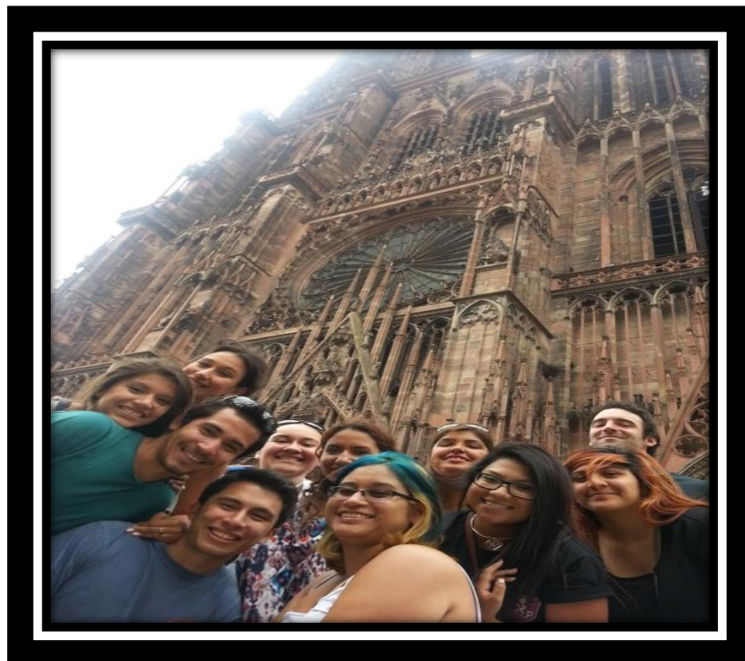
In front of Strasbourg Cathedral - Strasbourg, France