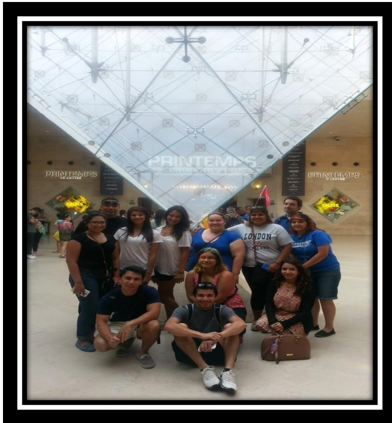
The inverted pyramid inside the Louvre Museum