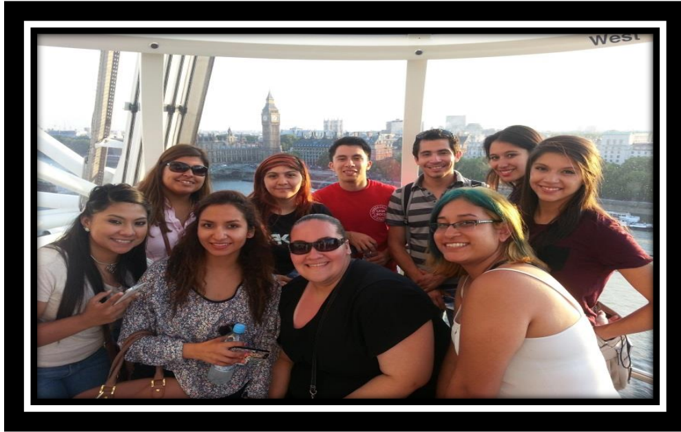
Inside the London Eye