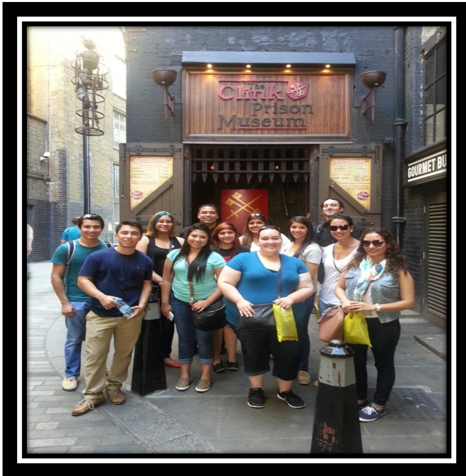
At the Clink Prison Museum