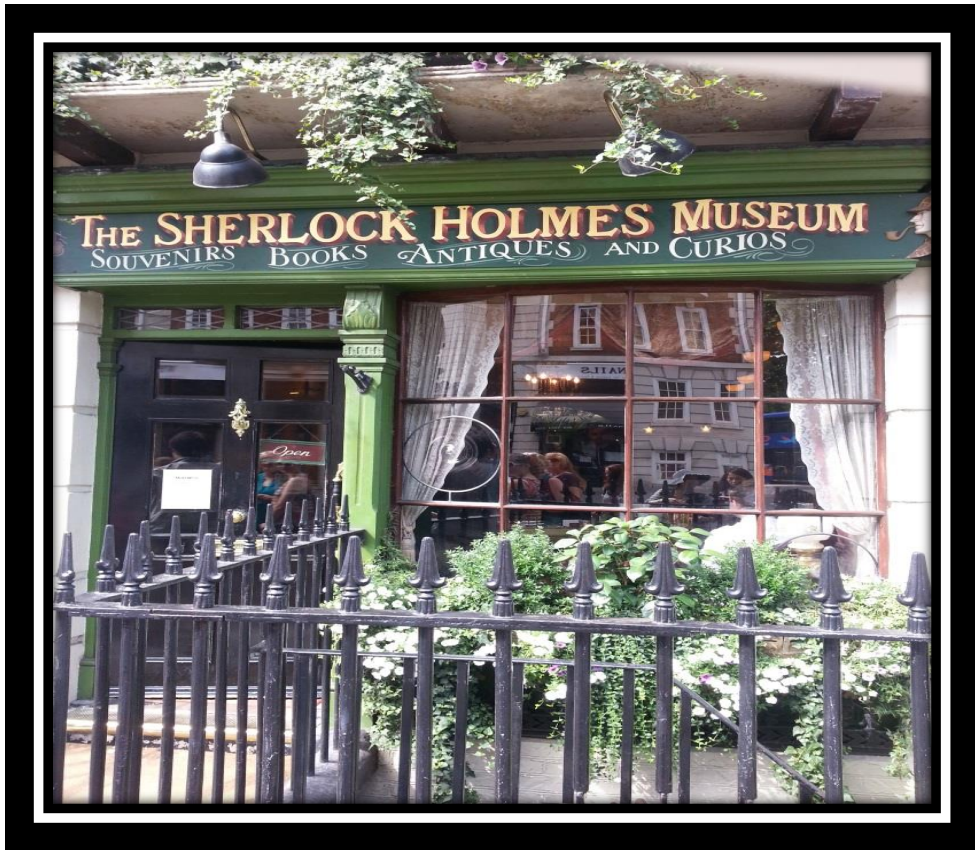
The Sherlock Holmes Museum