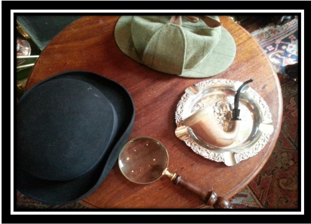
Inside the Sherlock Holmes Museum