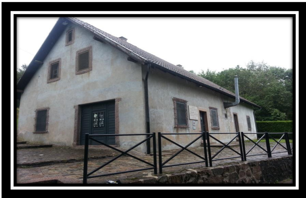
Gas Chamber at Natzweiler Struthof