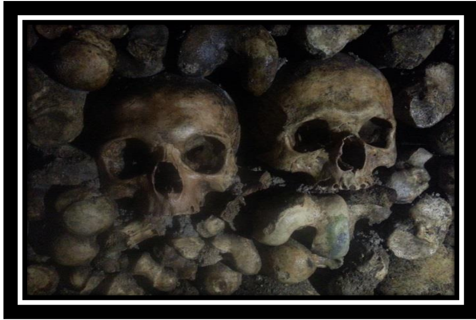
The Paris Catacombs