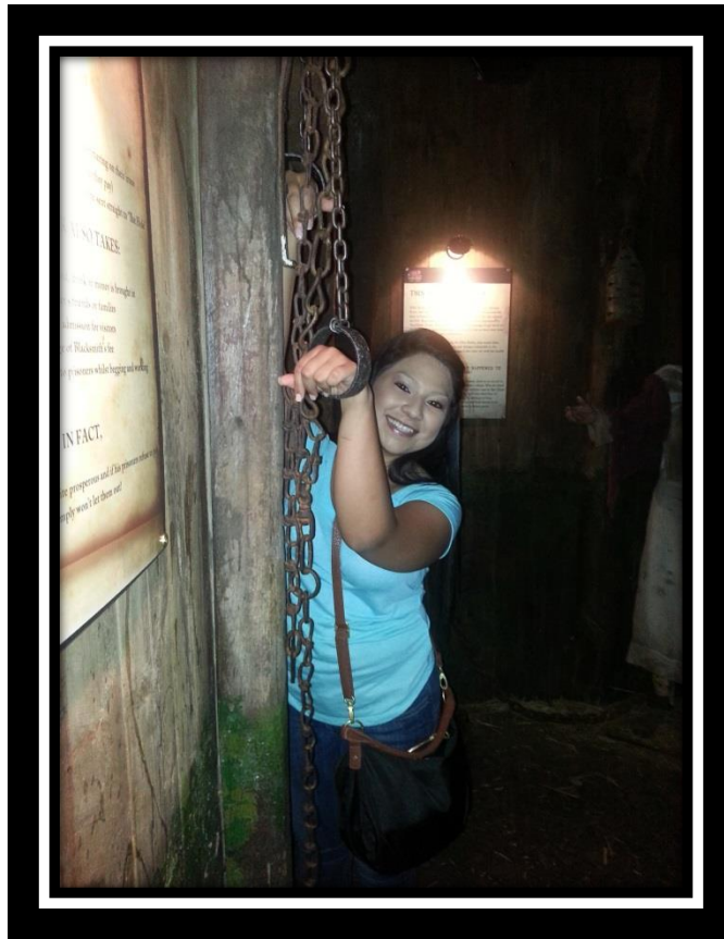
International Criminal Desiree Guardiola