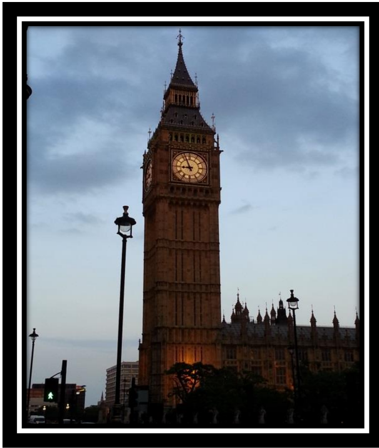
Big Ben Tower