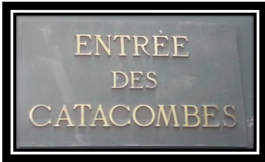
Main entry to the Paris Catacombs