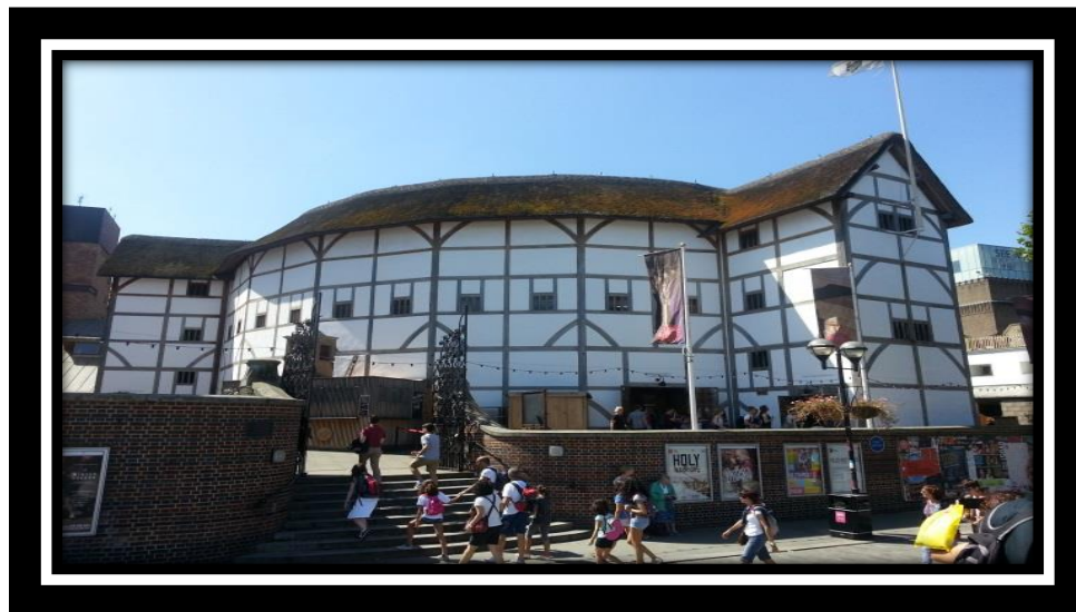
Shakespeare's Globe Theatre – London