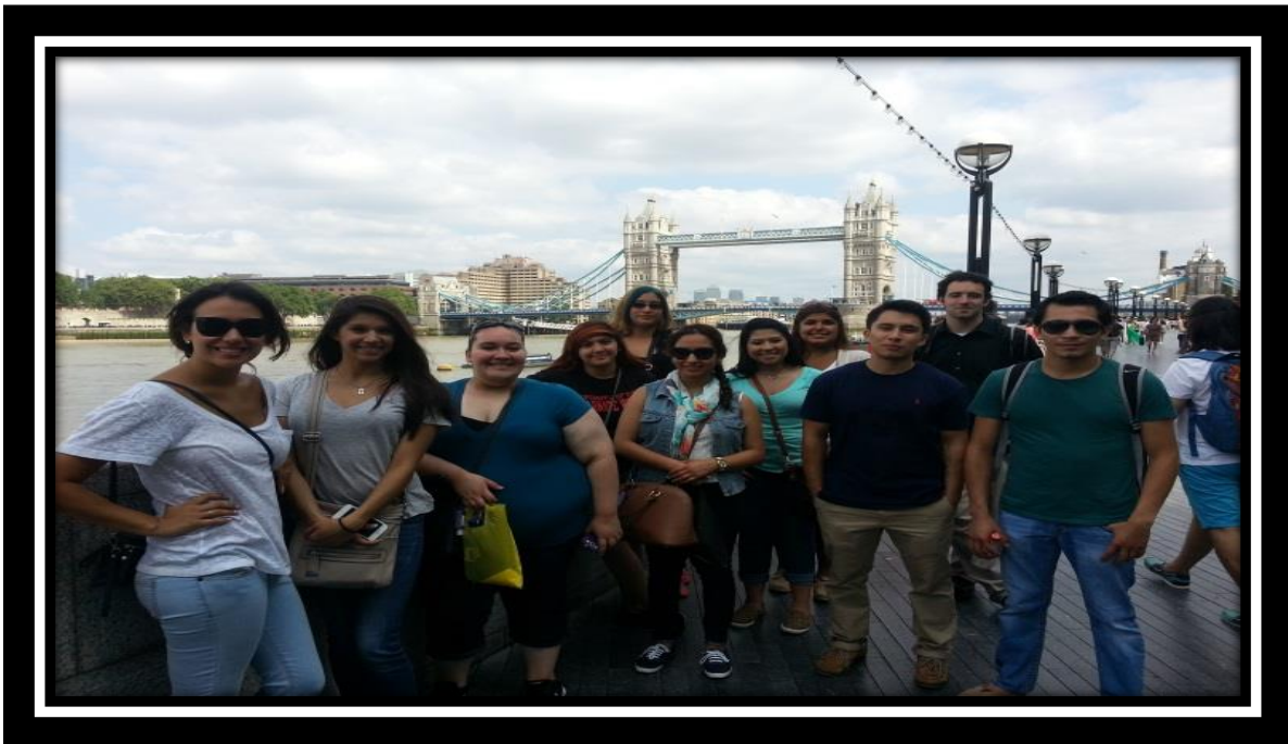
The London Bridge