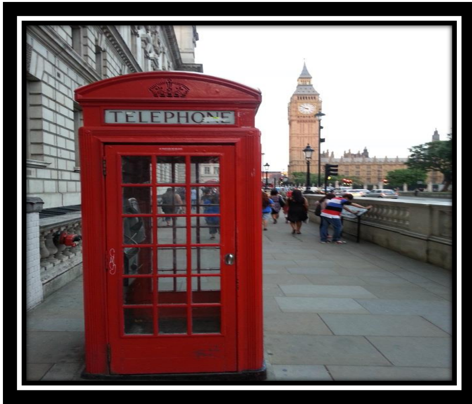
Big Ben Tower with the famous red phone booth in the UK