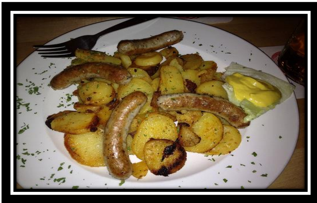
Traditional German meal (Bratwurst and potatoes)