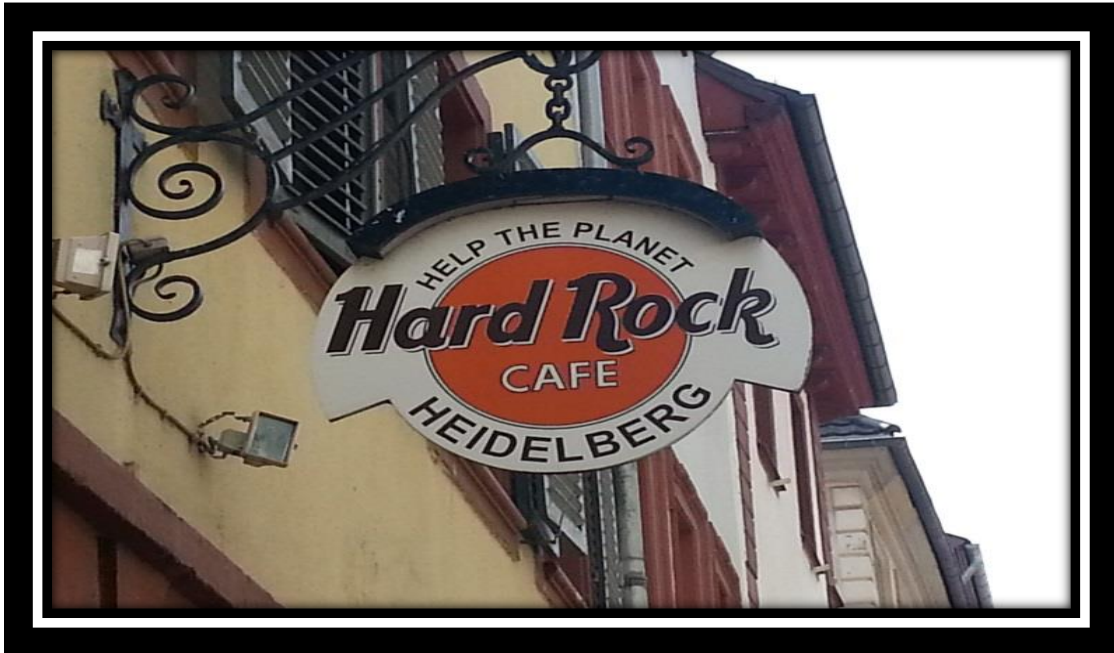
The Hard Rock Café - Heidelberg, Germany