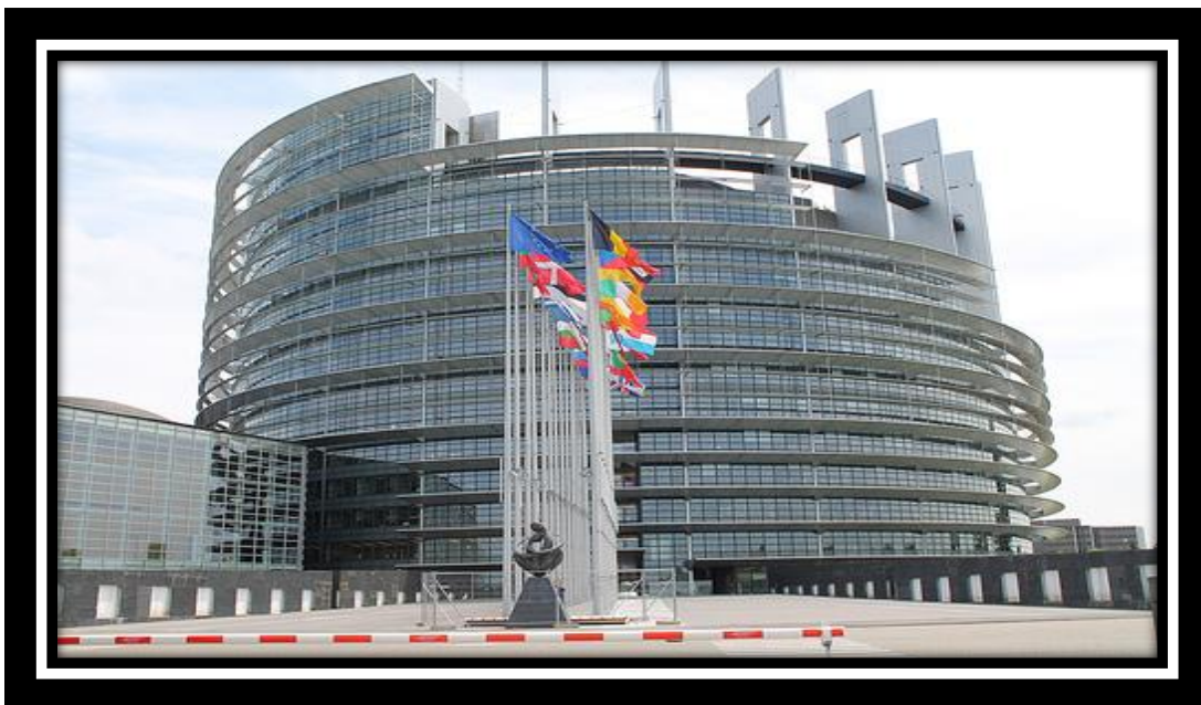
European Parliament in Strasbourg