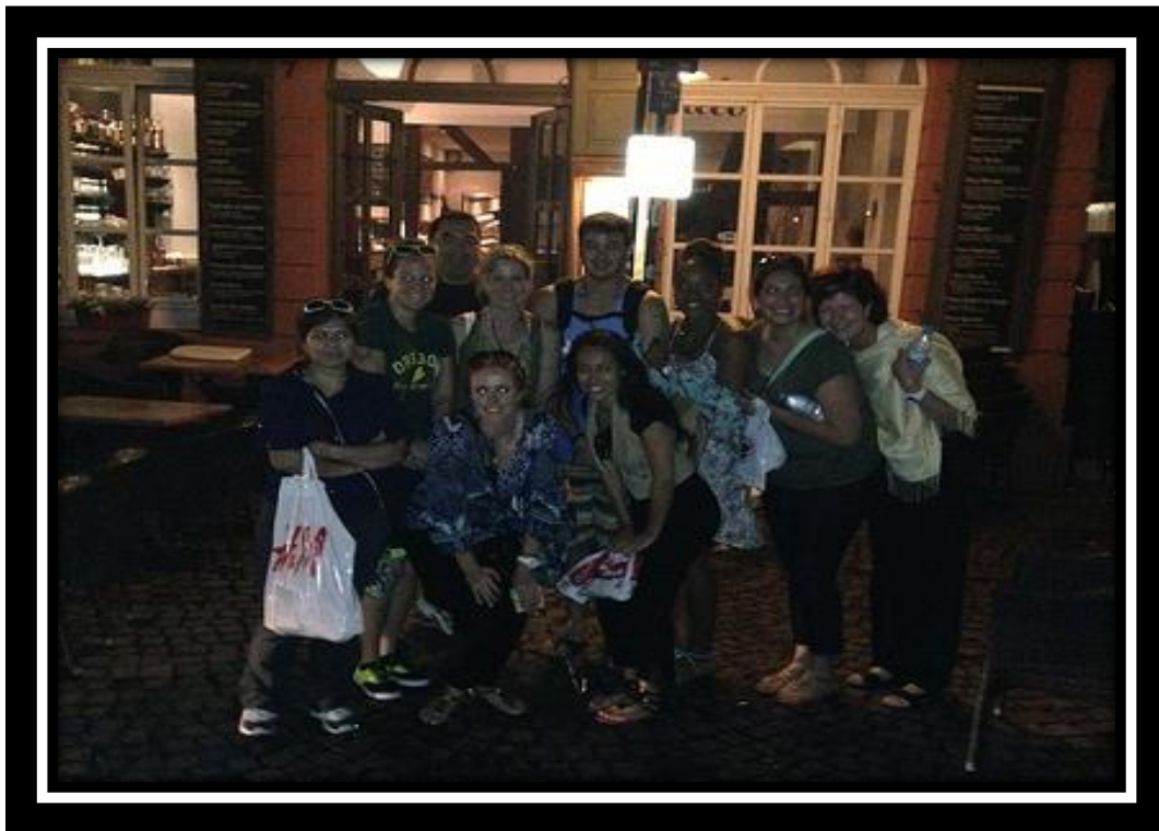
Good bye from Heidelberg, Germany. Until next year!