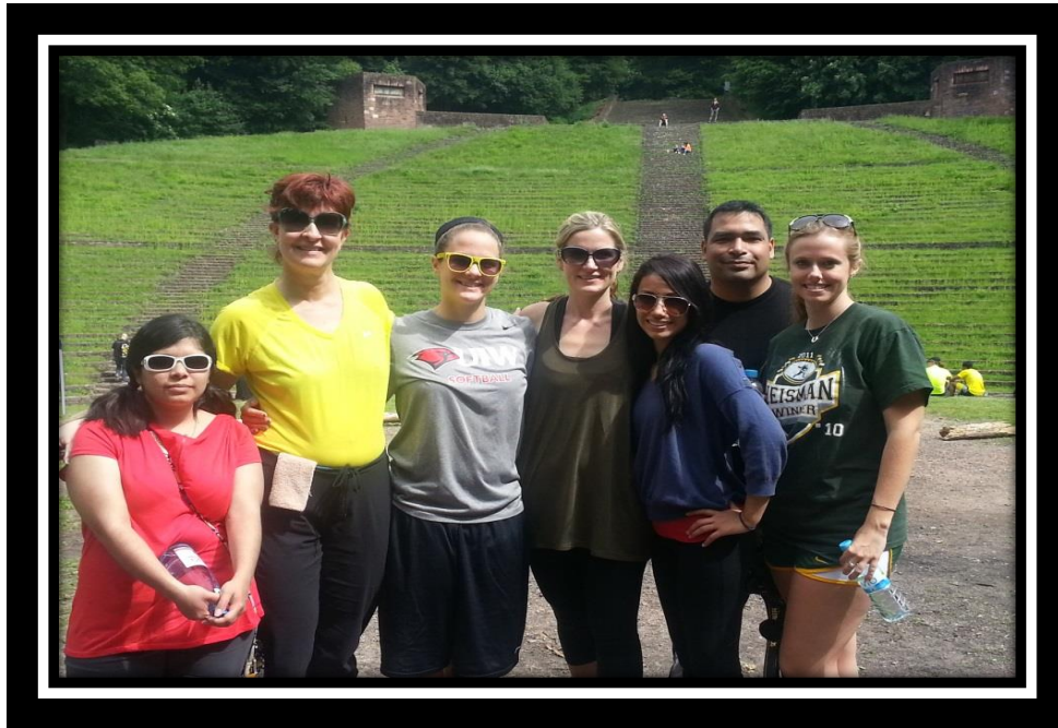
At the top of Philosopher's Way; in an Amphitheater, where Hitler would rally large crowds.