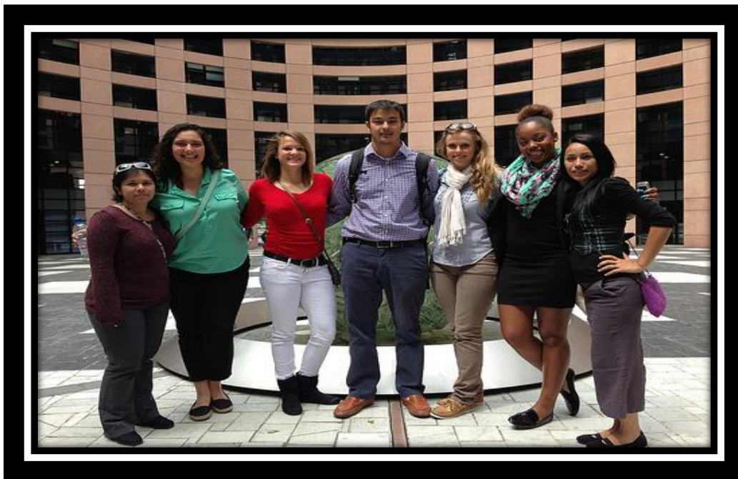
Students at the European Parliament.