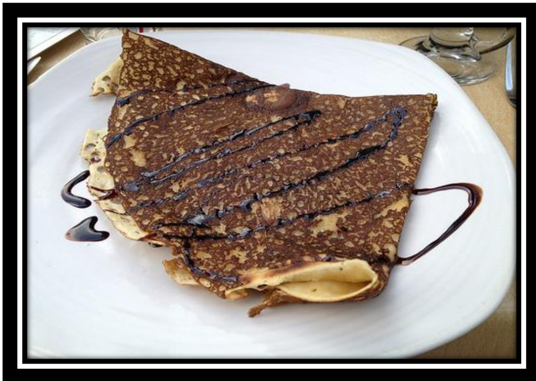
A French crepe from Strasbourg, France.