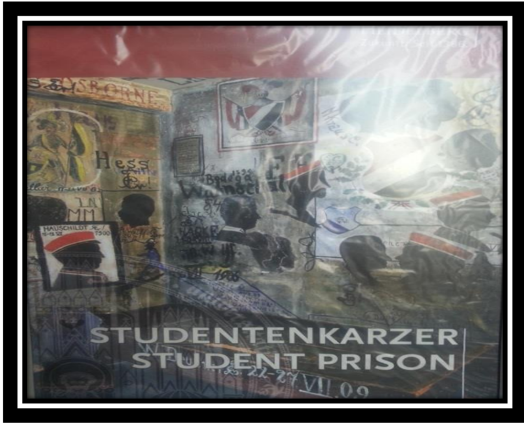
A Student Prison (Studentenkarzer)