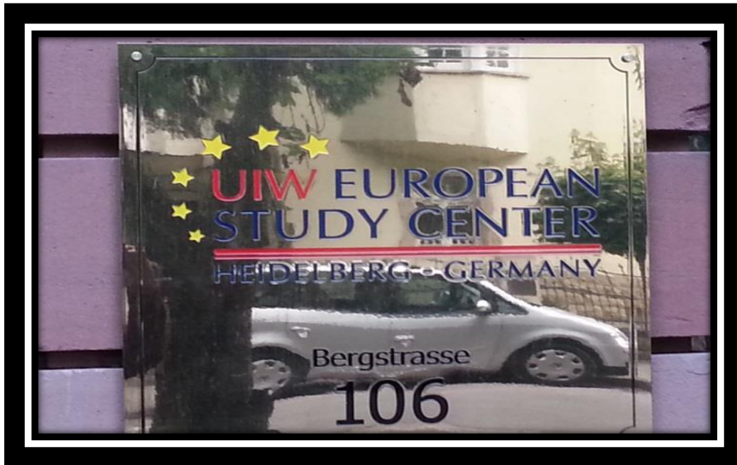
The UIW European Study Center