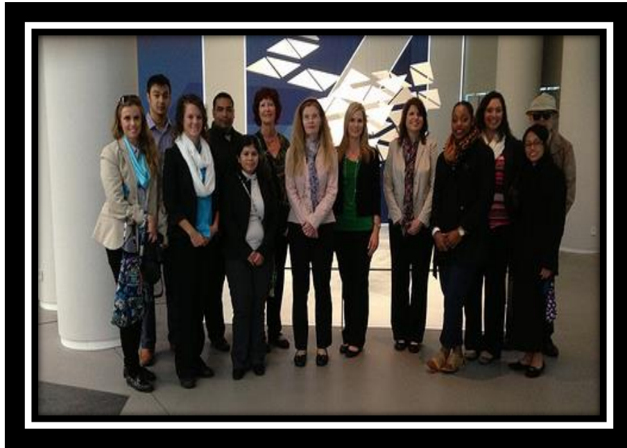
Visiting Deutsche Bank