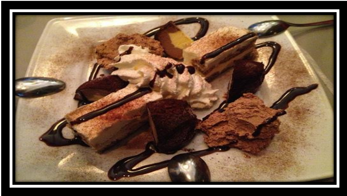
A German dessert in Heidelberg