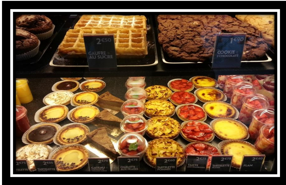
A variety of delicious treats from a French bakery in Strasbourg.