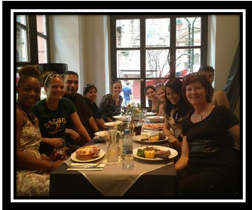
A group dinner at Heidelberg.